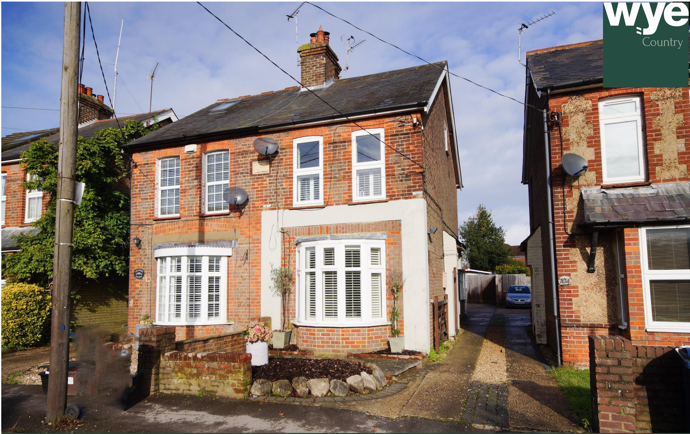
1 Arlington Cottages 106 High Street Prestwood Buckinghamshire HP16 9HA